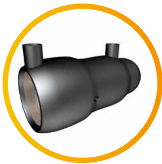
Reducer end cap