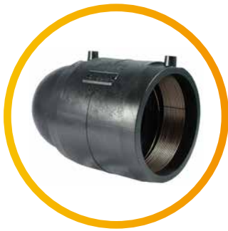
1-piece end cap